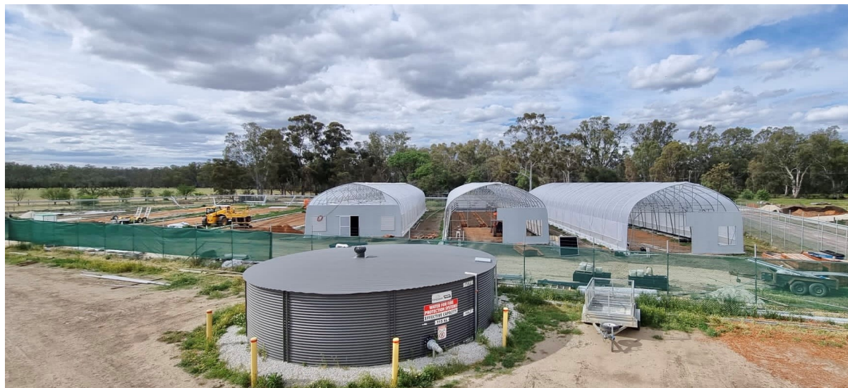
Figure 1: Victoria - Additional protected cropping enclosures under construction

company is in negotiations with further domestic and international operators to progress sales opportunities.